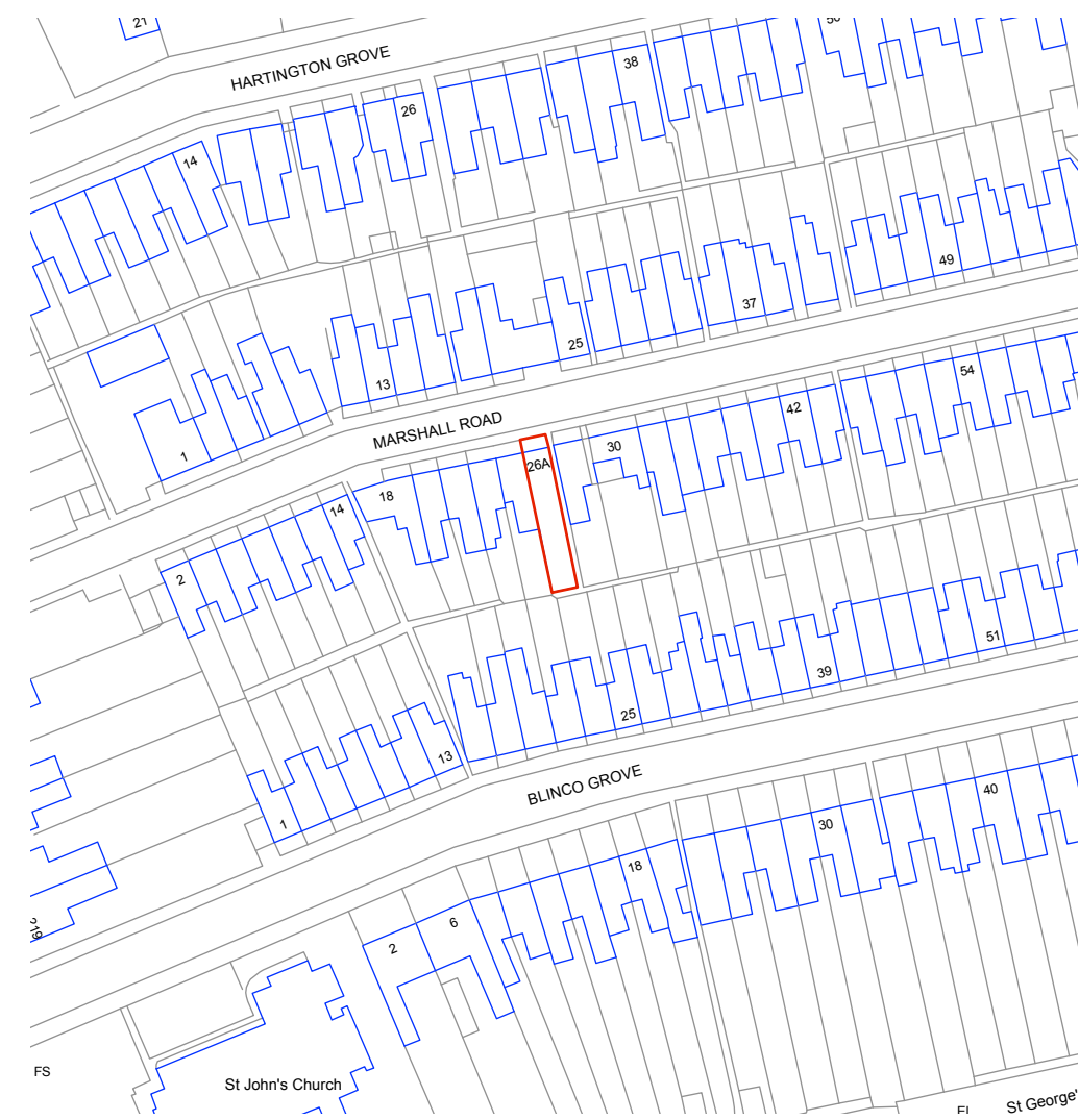
20m 0 20m 40m 60m LOCATION PLAN (Scale 1:1250)